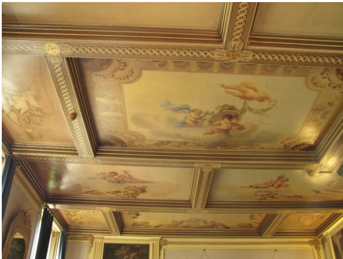
Fig. 2. Blue Salon: detail of the ceiling and walls with the decorative strap-work.

yellow scheme is a touching-up done after the WWII, based on the previous underlying light yellow phase that is mainly the result of a redecoration in 1860. Initially, at the start of this project, the first light yellow phase was thought to be applied in the early twentieth century. Architectural paint research, together with understanding both the tangible and intangible aspects, has changed these earlier assumptions about the decorative scheme in the Blue Salon.