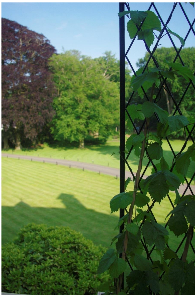
Fig. 8. Detail 1860s pergola on the balcony of Kasteel Keukenhof, showing how the original trellis wallpaper would have worked in the Tower Room.

These case studies show that understanding the decorative synergy of a room is the key to preserving the function, context and aesthetics of an interior. This synergy can be enhanced by a single decorative element in a room which has a unifying role, like the linen strap-work in the Blue Salon. It can be the relationship between a decorative finish and its cultural or material value, as is the case in the Count's Bedroom. It can also be the understanding of the context of the room within the broader setting of the castle and the surrounding grounds, as in the Tower Room. Each of these three case studies show how an initial rigid conservation strategy was revised, by considering and understanding the decorative synergy that is formed by intangible characteristics such as origin, coherence and interdependence of their interior decoration. This was made possible by communicating a collective understanding of the decorative synergy within individual interiors, using a holistic approach, material analysis, material knowledge, and intuition.