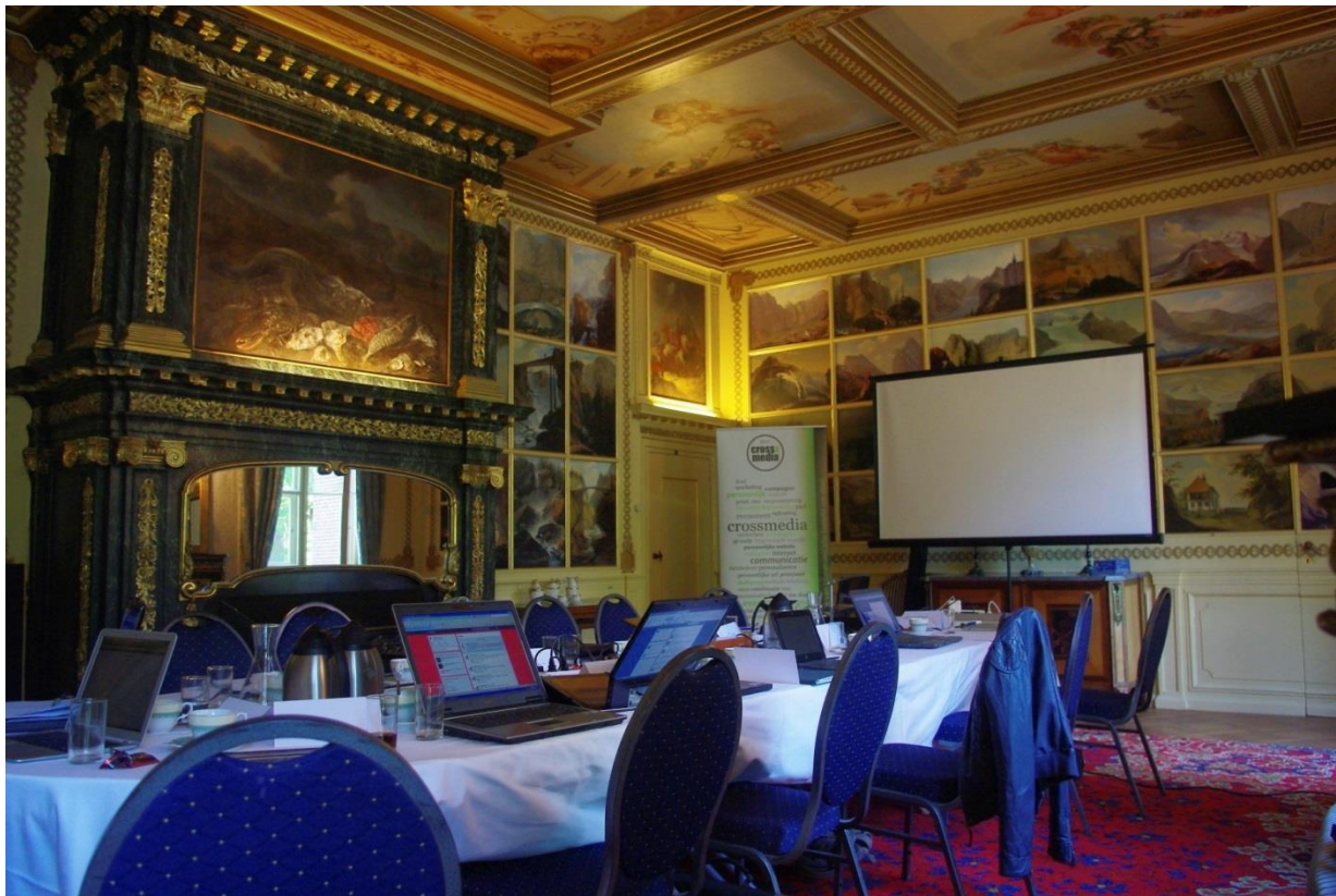
Fig. 3. Blue Salon after conservation. This room is now often in use for wedding and conferences. Here the large mantle piece is visible together with the ceiling paintings and the reinstalled replica eighteenth century Caspar Wolff landscape paintings. May 2012.

The authors strongly rejected these ideas and argued that the Salon consists of more elements than only the painted wooden panelling and the ceiling paintings (tangible aspects). We questioned how the decorative strap-work could be connected in an historical context to the dark green scheme, supposedly applied in the 1860s. More importantly, we also doubted if the decorative strap-work on the wainscoting could be associated with the dark green colour scheme in an aesthetical context (intangible aspects).