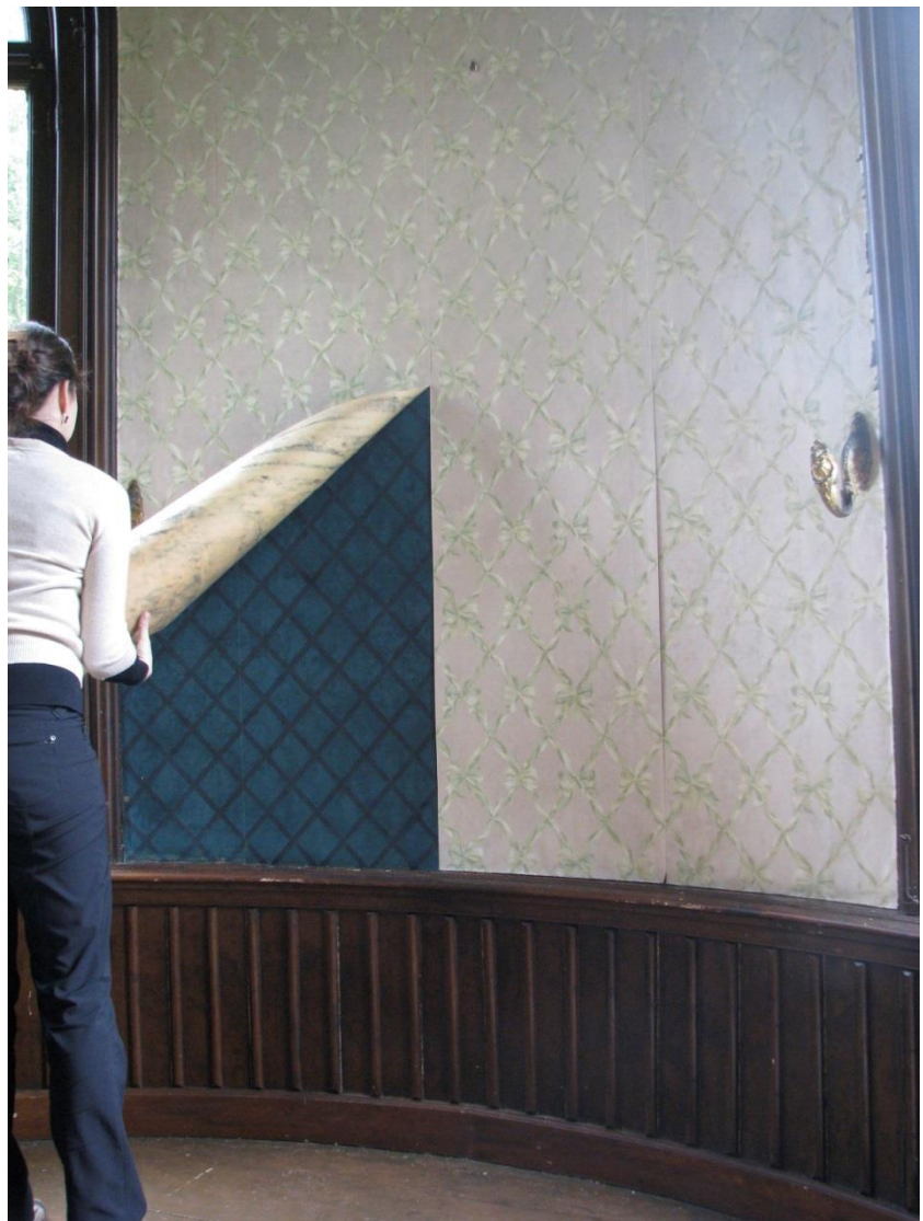
Fig. 6. Tower Room: wall with original 1860s wallpaper, and later 1950s wallpaper.

set in diamond pattern and would have reflected the trellis of the original wallpaper. In this way, the walls and the window comes of the