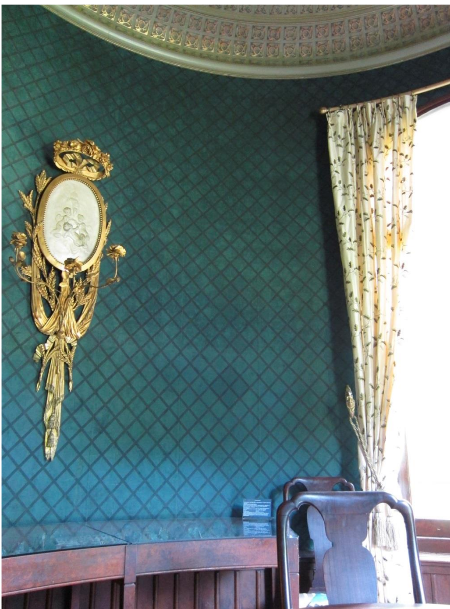
Fig. 7. Tower Room: after conservation. May 2012.

The main goal of the second conservation campaign in 2010 was to return the meaning and function of the Tower Room by uncovering the original wallpaper. In this case, there was sufficient time between 2008 and 2010 to carry out a pilot study. The pilot project allowed all stakeholders to assess the proposed result and see how the original appearance would work in reality. This allowed time to discuss treatment options and results before a long and complex treatment began. The function of the decorative scheme in the room as a binding element between the garden and the castle was explained by the