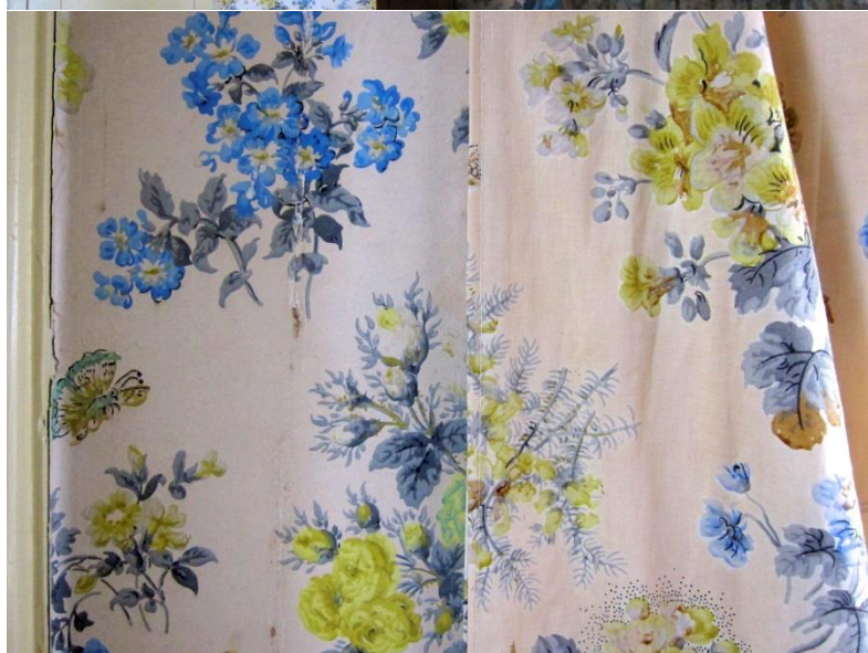
Fig. 4. Top: Count's Bedroom: after conservation.